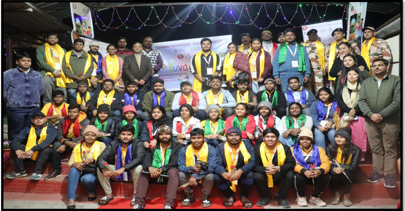
Group Photograph with Odisha delegates, Director -NIT Sikkim and Host teams

REPORT ON STUDENTS VISITS FROM ODISHA TO SIKKIM