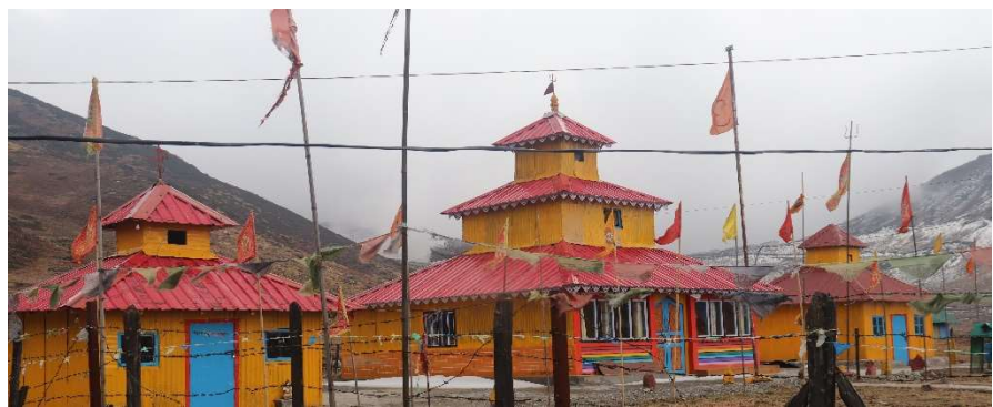
Glimpse of GNATHANG Village (13400 ft)