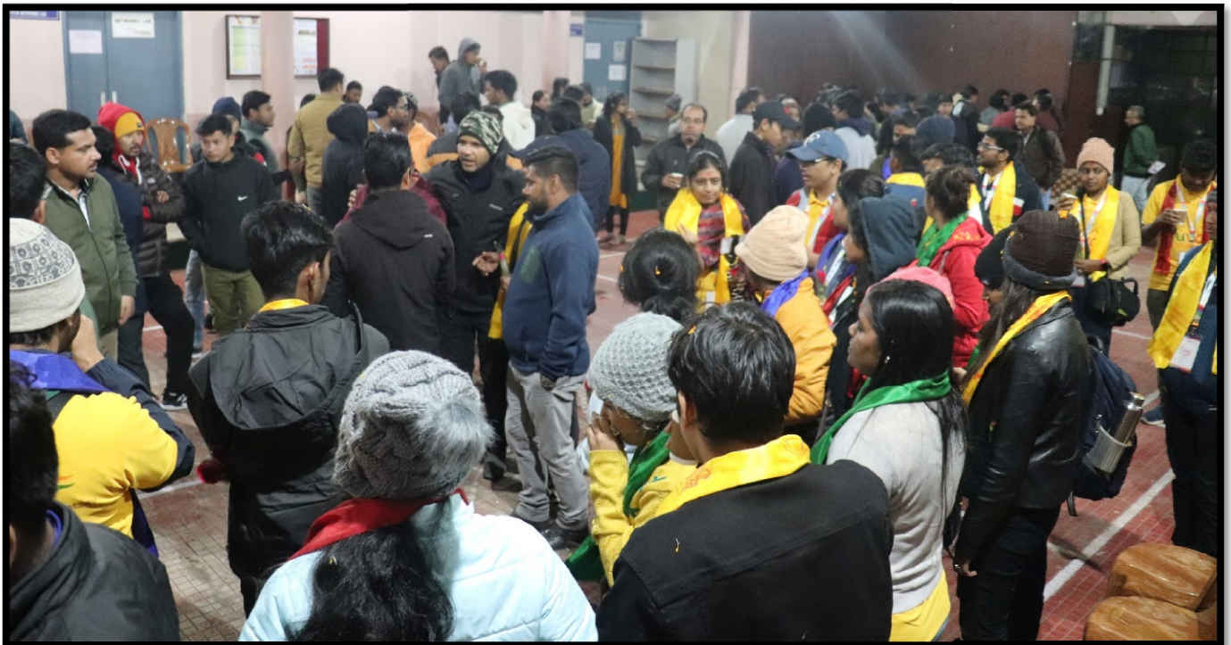
Interaction with buddy friends and coordinators at NIT Sikkim